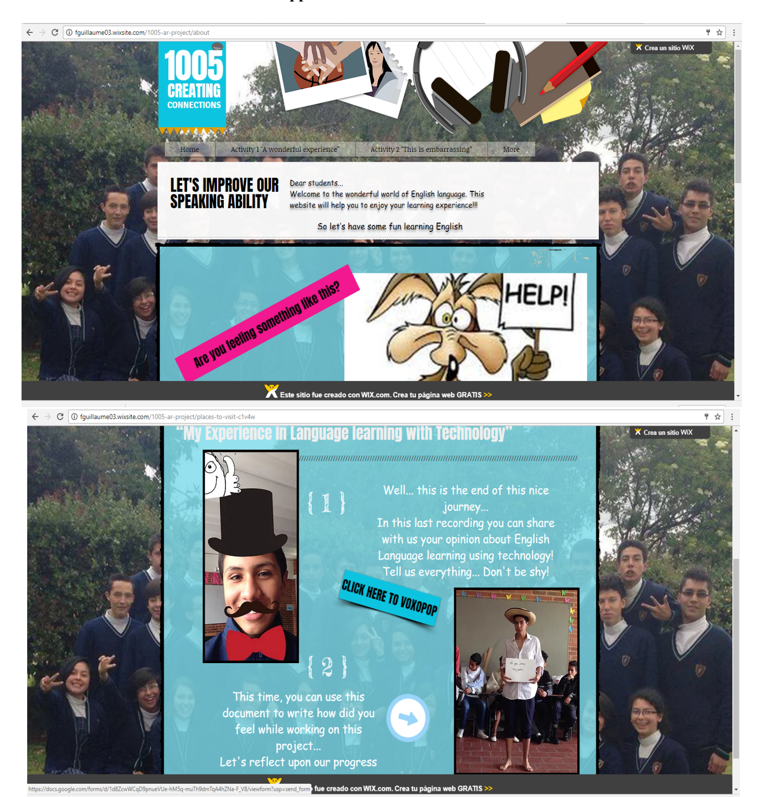
Appendix H: Website Screenshot