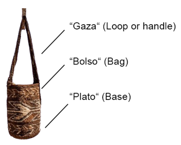
Figure 2. Mochila parts.