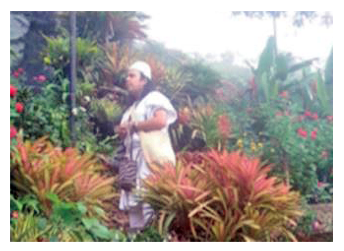
Figure 8. One of the Arhuaco community's Mamos.

such as water, food, air, plants, animals and all the resources that allows her to create her own spiritual and material world" (Dwrya)