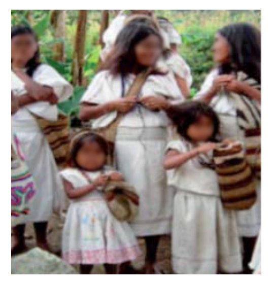
Figure 4. Grandmother teaches knitting fique.

"The first thing to learn when knitting fique is that wool is removed from maguey. Grandmothers teach us to know the plant and scrape it to extract fique, then wash it, place it in the sun until it unravels and then make rows of wool from it (Figure 4). This thin wool can be handled very well. Grandmothers teach us how to spin fique spinning on our legs. When we have the material ready, we are taught to use the needle carefully not to sting ourselves with it. We are taught how to make thick stitches and handle the needle. Then we are shown a "mochilón" - a big and simple bag from fique (see Figure 5) - used to carry bananas and yucca. With the help of their grandmothers, the girls have to make big "mochilones" (see Figure 6) for our families, and if we demonstrate that we can make them, then we can go ahead and weave bags, not any sooner". (Dwrya)