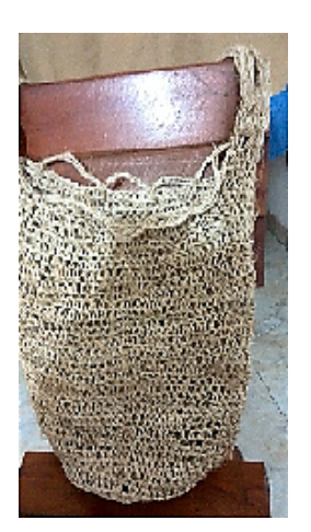
Figure 5. "Mochilón" knitted by an Arhuaco girl. Photo by Dwrya Izquierdo (2015).

Figure 4. Grandmother teaches knitting fique. Photo by Dwrya Izquierdo (2015).