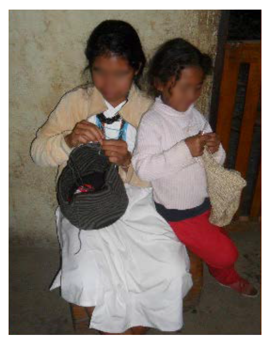
Figure 6. Arhuaco women and her daughter knitting one mochila and one "mochilón" respectively.

It is very interesting to analyze how grandmothers' collaboration and support play an important part in being introduced, from a very young age, to the practice. Older women in the family play an active role and teach young girls how to recognize and identify the plant. It is also significant to see how the child uses her body, in this case her legs and hands, while applying the new knowledge.