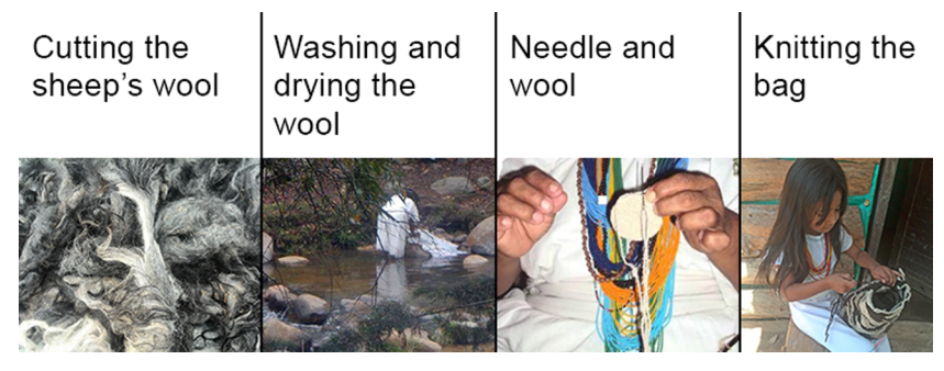
Figure 1. Process of mochila knit.

The mochilas themselves and the setting of this activity represent the material aspect being studied. Knitting mochilas is an activity assigned exclusively to women. The materials required by the task are: sheep wool, needle and spindle. The wool is washed and dried in the sun. Subsequently, it is wound on the spindle and finally the bag begins to be knitted with the needle; this process is reflected in Figure 1. Girls aged four and older are engaged in this practice along with their grandmothers.