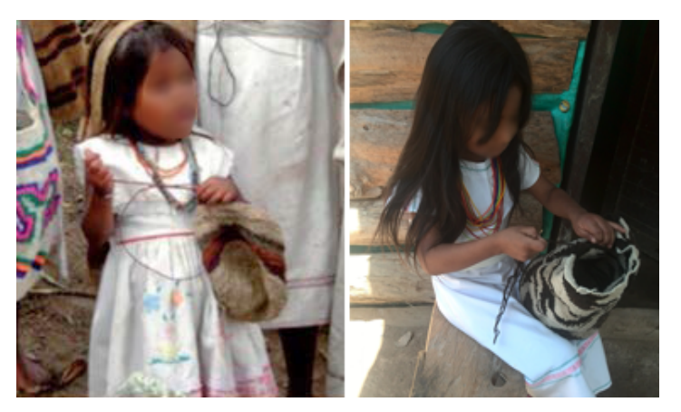
Figure 3. Two Arhuaco Girls Knitting.

Figure 2. Mochila parts.