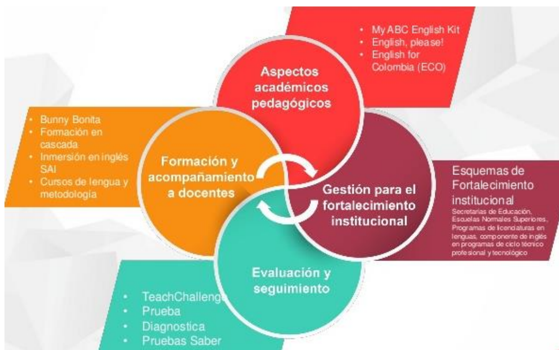
Figure 1. Taken from Proyecto de fortalecimiento al desarrollo de competencias en lenguas extranjeras. Illustrates the four axes by “Programa Nacional de Inglés Colombia, very well!!! Copyright, MEN July 2014.

government] does not allow for the presence of theory produced by the teacher through exploration. Moreover, the content presentation takes up most of the course time, thus limiting the space for reflection on the action taken” (p. 322). The English language teaching and learning policies have been set with an absence of discussion and language teachers’ voices have not been heard. From that sense, there is a need of a construction of a professional development program based on the understanding on local needs and the teachers’ active participation to foster an adequate English language educational change.