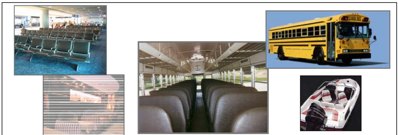
Figure 2: Vinyl Applications

The challenge is to improve the level of customer satisfaction, specifically in terms of deliveries fulfillment and reducing the inventory levels that the company has been carrying during the years. The trends force to have multiple markets that generate a complex and variable supply, in the case of Proquinal, the majority of the portfolio corresponds to references Make to Order, which require a regular customer to generate a previous order and wait for the regular production lead time in order to have the finished products available for shipment. The problem is that the market is demanding shorter