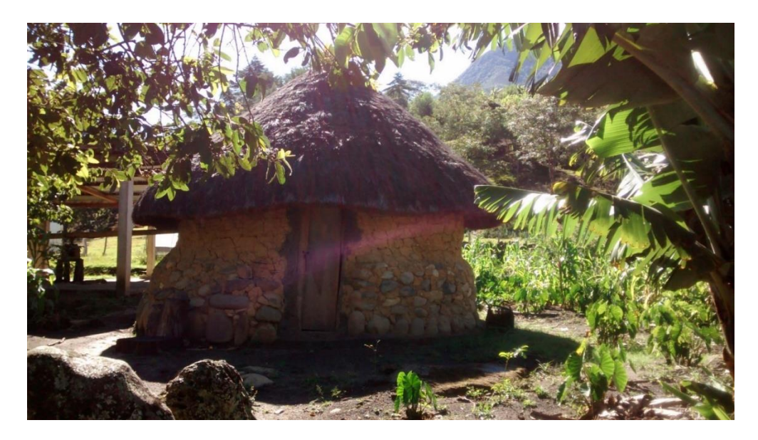
Figure 3. Picture of Traditional mud house in the primary school in Nabusimake, SNSM.