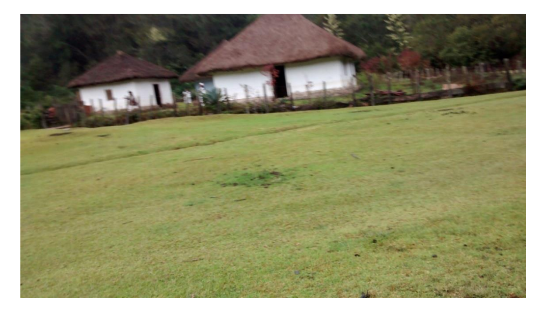
Figure 4. Picture of Traditional family house in Nabusimake, SNSM. Source: Self taken.

Figure 3. Picture of Traditional mud house in the primary school in Nabusimake, SNSM. Source: Self taken