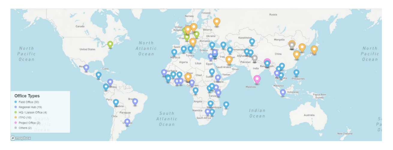
Figure 2. UNIDO worldwide. Field network (United Nations Industrial Development Organization, s.f.)

of UNIDO in the field has gained importance through its forty-eight regional and country offices across the globe, aligned with the decentralization processes of decision-making process at the national level (Figure 2).