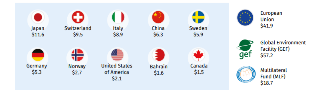
Figure 4. Top funding partners for UNIDO programmes and projects in 2022. (United Nations Industrial Development Organization, 2023)

UNIDO implements projects around 120 of its 171 Member States. For 2023, the portfolio comprises 636 projects for US$1,350m, from reducing mercury use in several countries, including Colombia, Burkina Faso, and China, to strengthening the formal private sector in Algeria, Egypt, Jordan, Lebanon, and Morocco. For 2022, in addition to the European Union, the Global Environment Facility (GEF), and the Multilateral Fund (MLF), Japan, Switzerland, and Italy were at the top of funding countries (see Figure 4).