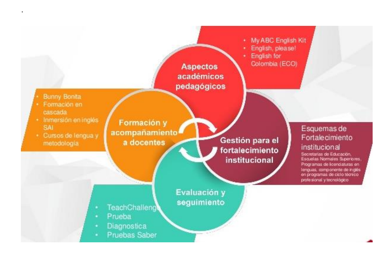
Figure 1. Taken from Proyecto de fortalecimiento al desarrollo de competencias en lenguas extranjeras. Illustrates the four axes by "Programa Nacional de Inglés Colombia, very well!! Copyright, MEN July 2014.

government] does not allow for the presence of theory produced by the teacher through exploration. Moreover, the content presentation takes up most of the course time, thus limiting the space for reflection on the action taken" (p. 322). The English language teaching and learning policies have been set with an absence of discussion and language teachers' voices have not been heard. From that sense, there is a need of a construction of a professional development program based on the understanding on local needs and the teachers' active participation to foster an adequate English language educational change.